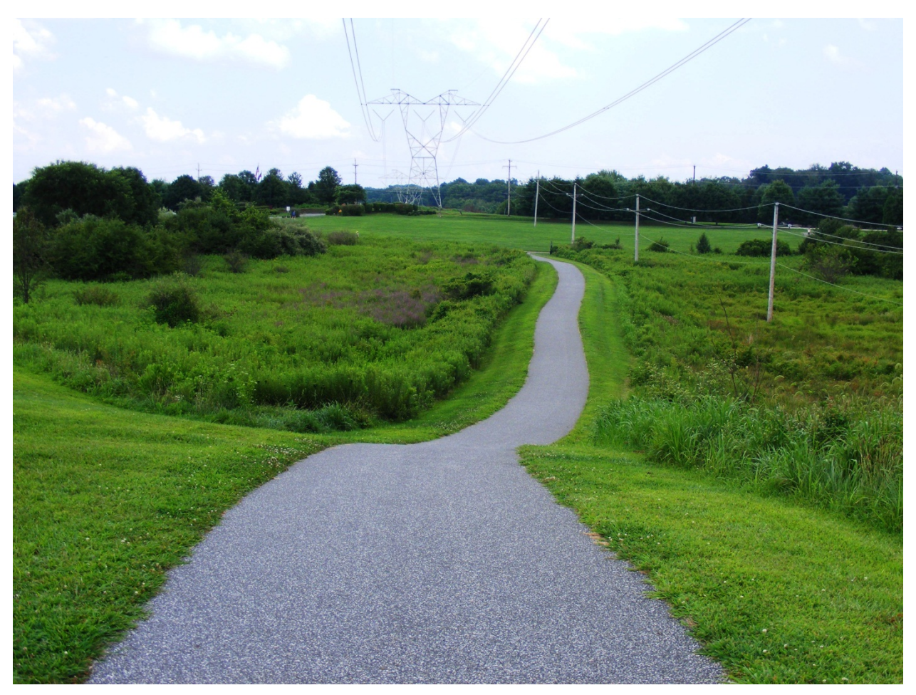
Figure 4-2: Concord Township Park Trail

Another type of right-of-way that could be used for a trail is the utility right-of-way. Power line and underground utility and fuel pipelines, as well as sewer and communications rights-of-way, are examples. In other counties, PECO has been agreeable to allowing paved multi-use trails on its rights-of-way. One reason companies may not mind a public trail on their right-of-way is that it would help provide easier access for maintenance vehicles, enabling them to drive the length of it using the trail instead of navigating the road network to different stops or driving off-road. The various utility and fuel transmission companies that own or lease space in a right-of-way each have their own concerns regarding safety and security that need to be addressed as part of a trail feasibility study for a corridor.