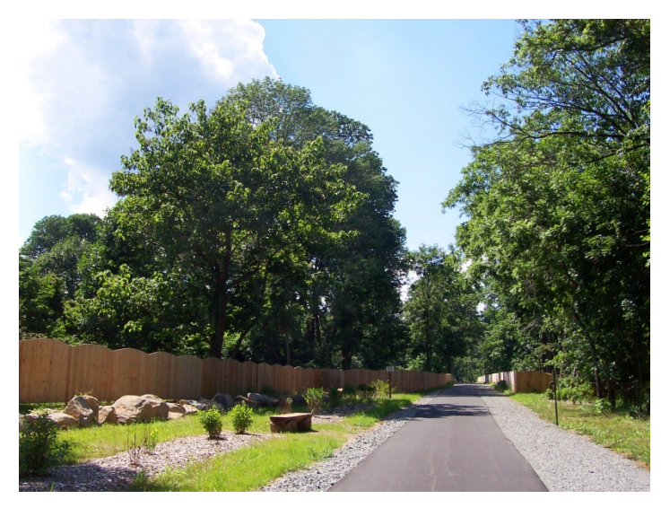
Figure 4-1: Radnor Trail

It is also important to note that not all trails along former rail rights-of-ways are on railbanked land. One of the most popular examples of a rail trail in Delaware County is the Radnor Trail, which was built