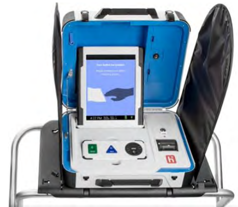
Hart Touch Writer Voting by the Touch Writer takes up to 8 minutes

Videos on the Hart Verity 2.3.4 Voting System can be found here: www.delcopa.gov/electionsbureau/index.html