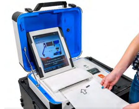
Hart Scanner Voting by paper takes about 90 seconds

The new Hart Verity 2.3.4 system, certified by the PA Department of State, is a paper ballot system that offers plain text which voters can read to verify their vote before casting their ballot.